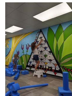
Otter Cove Children's Museum