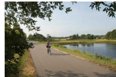
The 55-mile Central Lakes State Trail runs between Fergus Falls and Osakis